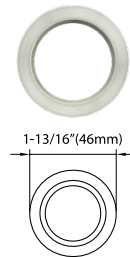
FH2203 Flush Pull w/ Cylinder Hole