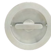
FH2282 Flush Pull w/ TT08 Thumbturn